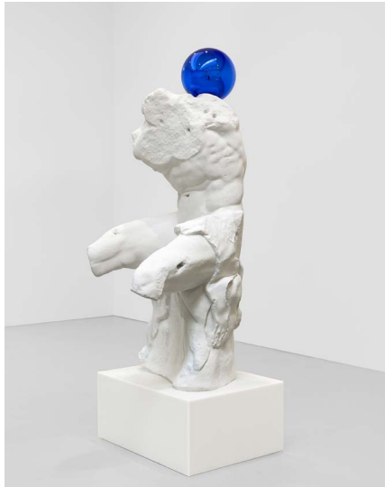
Jeff Koons (b. 1955) Gazing Ball (Belvedere Torso) plaster and glass 181.6 x 75.9 x 89.2 cm © Jeff Koons Artist's proof Edition of 3 2013

sculptures, meticulously painted replicas of European masterpieces, and museum-style plaster-casts of mundane objects such as mailboxes and birdbaths. They continue Koons's experiments with the remade 'readymade', the meeting of high art and the vernacular, while engaging in a new way with the art of the past. Shown in the UK for the first time will be seven works from the series including Gazing Ball (Belvedere Torso) (2013), Gazing Ball (Gericault Raft of the Medusa) (2014–15), and Gazing Ball (Titian Diana and Actaeon) (2014–15).