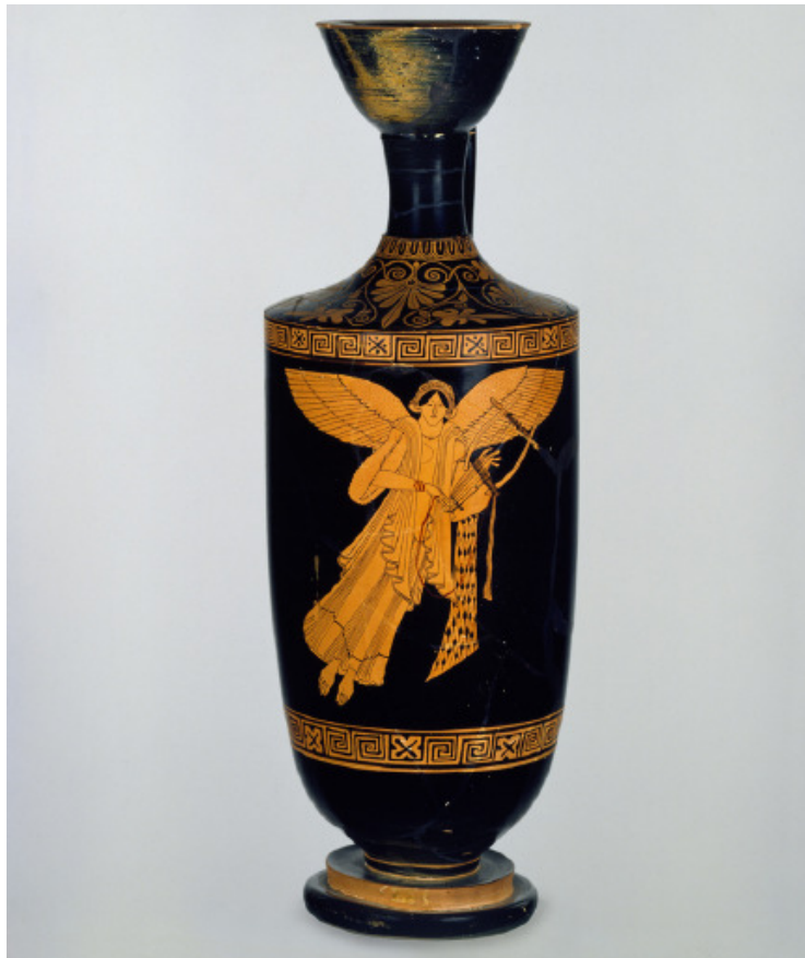
This oil jar (lekythos) is on display in Gallery 16, Greece. It shows the winged goddess of victory, Nike, playing a lyre.