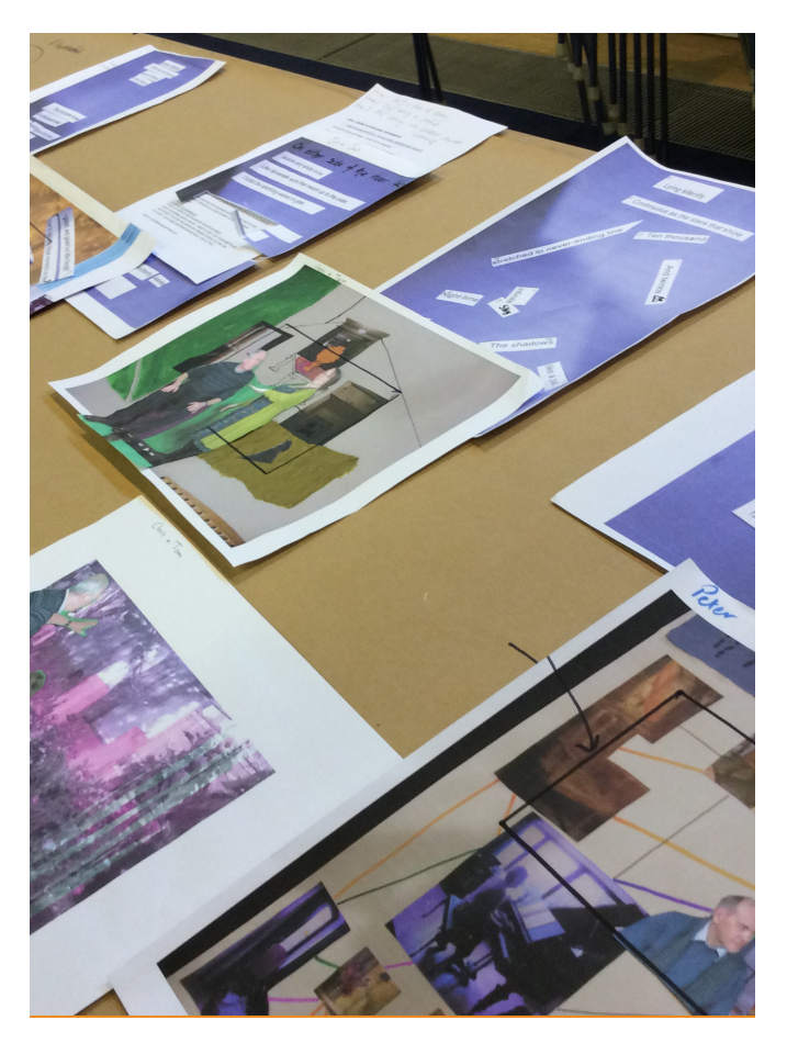
YDUK storyboard their work for the final film

The education team used the public event planned for the 13 May as an opportunity to showcase both the participants' work, and the art pieces produced by brook & black in parallel. The Mind and YDUK films were projected into the main atrium, and the upper galleries were opened specifically so that the artists' work could be seen.