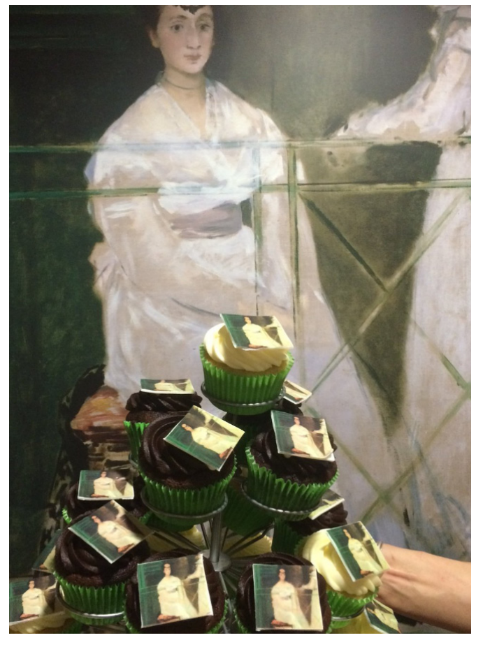
Celebrating achievements with cupcake mementoes

Another described the session as 'clarifying' and 'thought provoking'.