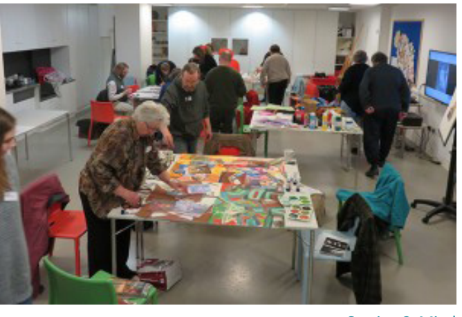
Session 2, Mind

'Throughout the workshops, I was struck by the insightful perspectives of the participants and the depth of their responses... I came away from the sessions feeling calm and inspired – an extremely cathartic experience.'